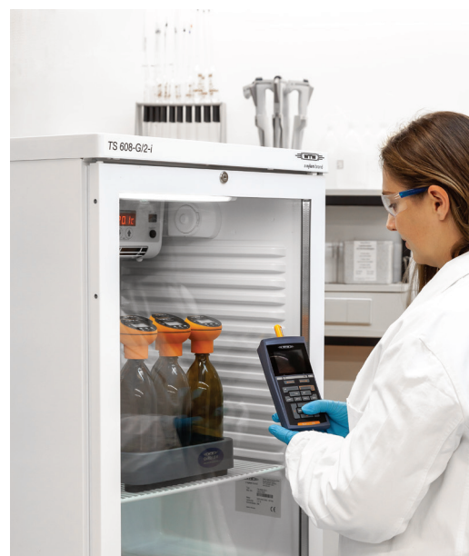
Fig. 6: Measure three parameters simultaneously with the digital pocket meter Multi 3630 IDS.