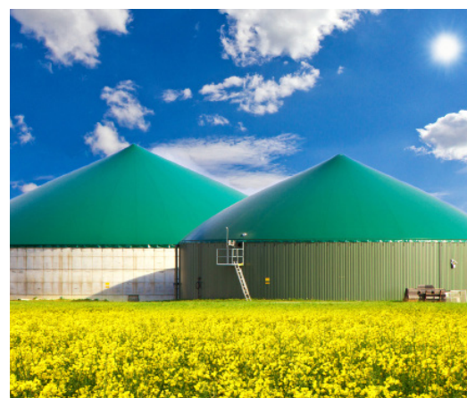
Fig. 1: After wastewater sludge, both pastoral and arable farms contribute significantly to biogas feedstock supplies in the United Kingdom.

However, as more local authorities introduce household food waste collection, a significant increase in organic AD Biogas production at local waste sites has been seen over the past few years, which is set to rise further as landfill sites become more scarce across the country and around the World. Additionally, schools, restaurants, supermarkets and food manufacturers including Coca-Cola, Heineken, Nestle, BV Dairy, (source: ADBA 2015 Annual Report) are also taking advantage of turning organic waste or spoiled product in to energy in an attempt to generate income and reduce disposal costs by installing AD plant at major sites. In fact, the sugar industry has always made good use of its waste by burning leftover cane or beet husks (bagasse) as fuel for electricity after the sugar juice extraction process but is now also adopting AD as a viable means of energy production.