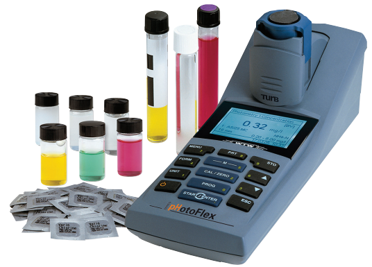
Fig. 3: The pHotoFlex TURB is capable of providing pH, COD, turbidity and ammonia readings from a single handheld meter.

FOS/TAC is simply achieved by wet chemistry titration (ref.: Mc Ghee-1968 & Nordmann-1977) however, for relatively little investment, the SI Analytics TitroLine® 5000 auto-titrator, with built in FOS/TAC method and burette, provides daily analysis of