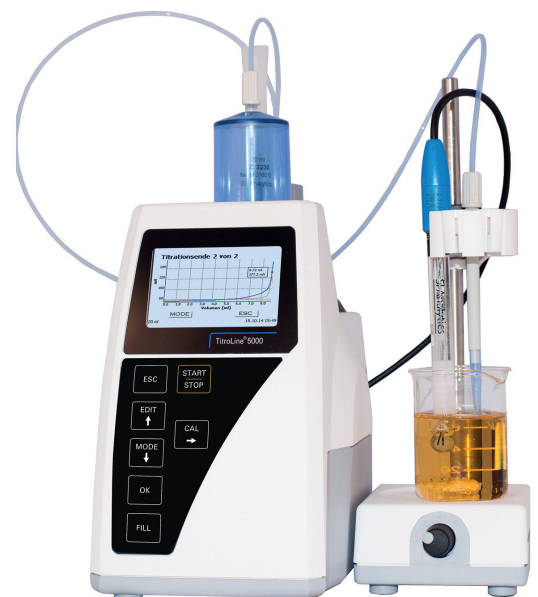
Fig. 4: SI Analytics TitroLine® 5000 auto-titrator with integral FOS/TAC method provides a simple means of monitoring a fermenter's stability so that catastrophic failure may be avoided.