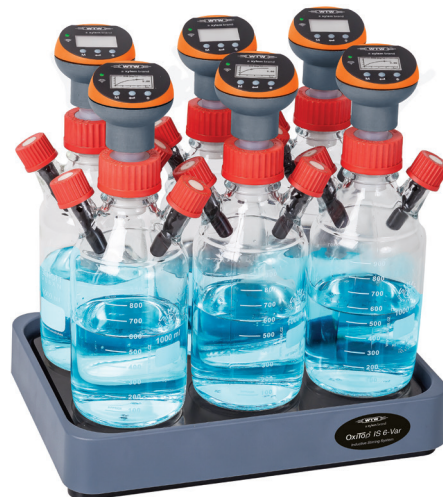
Fig. 5: OxiTop® measuring heads are specifically designed to withstand corrosive hydrogen sulphide gases and provide a means of emulating the fermenter's performance.

It goes without saying though, that plant continuation represents the most important in terms of yield and profit as, if the bio-reaction fails, the costs and time involved to restart will not only have a detrimental effect on that particular fermentation, it will also directly affect the entire site’s overall profit generated during any other active run. As such, continuous measuring of FOS/TAC is the most important measurement to be considered for local analysis at the biogas plant.